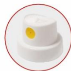
WHITE/YELLOW PAINTING PRODUCTS ACTUATOR

Remove the secure seal on the cap, to open the spray